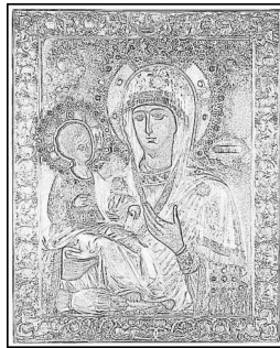
The "Three-handed" Icon of the Mother of God

For the occasion, we will have an akathist to the icon on Tue. at 6 p.m.